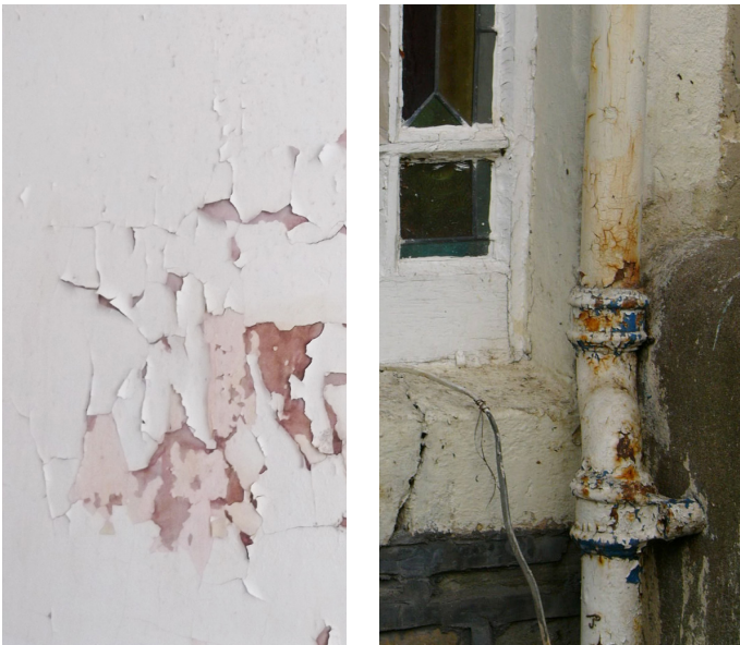
Penetrating damp can cause paint to flake. It can be caused by structural issues like cracked masonry or leaking guttering